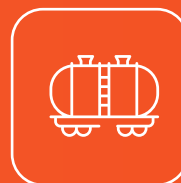
Oil and Oil Products